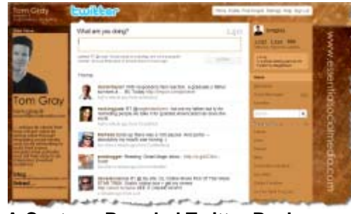
A Custom, Branded Twitter Background

Fortunately, if you have a little bit of talent with a computer or know somebody who does, it's fairly simple to create your own unique background. There are also several services that have sprung up which will create a free or low cost background from a variety of standard templates. If you do it yourself, you will need somewhat sophisticated drawing/graphics program or, again, know someone who does. MS Paint, if you're a Windows user, won't do. Apple may have tools but I don't use it so I don't know. Something like Adobe Photoshop will work. There's also a free, image editing program called Gimp ( www.gimp.org ) which may do the trick if you can master the learning curve. If your program can create or save images in *.jpg, *.gif or *.png, it should work.