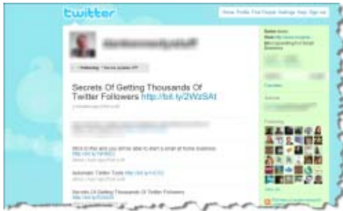
A Plain Vanilla Twitter Background

When you're on Twitter for any length of time and start looking at other people's profiles, you realize that most of the well established, more professional tweeters have their own branded, custom designed background.